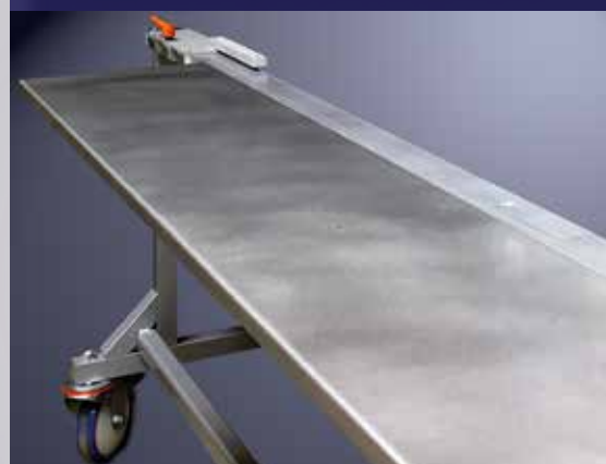
Supporting table (Option)

Example: • Sewing length 3,600 mm • Frame length 4,850 mm • Fixation of the fabric: Right and left holders combined with intermediate holders