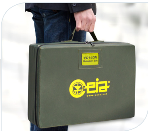
PD140N Hand Held Detection Set with carry bag