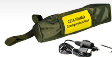
HHMD Configuration tool