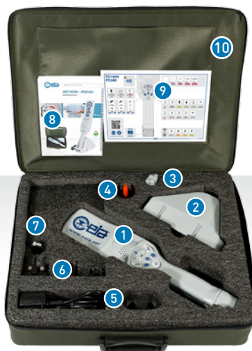
PD140N Set inside the Carry Bag